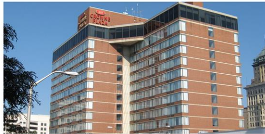
Crowne Plaza Dayton, OH

Please note that Delta Alpha Chapter will not accept credit card information for hotel reservations. Please call the hotel directly using the number listed above or use the link provided on the District Meeting Registration Page for hotel reservations.